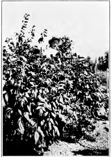
Two Jane Cowl grown in California from our plants delayed 13 days because misdirected and the man who grew them. Our plants are like that.

INDIANA MOON F. D. (Martin) —Color, Flesh ocher, flushed pink, salmon and gold. Huge flowers of color, beauty and form on a vigorous, beautiful plant with disease and insect resisting foliage. A 1932 introduction bearing high endorsement of Eastern growers. 1930 Certificate of Merit Dahlia. $10.00 each, Plants, $5.00.